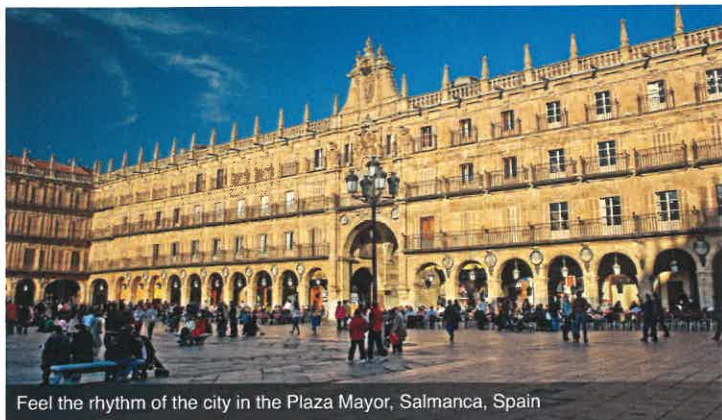
Feel the rhythm of the city in the Plaza Mayor, Salamanca, Spain

fore arriving at the stone archway entrance to the walled village. An inside visit to the well-preserved Church of Our Lady of Rocamadour showcases relics of the period. See the ruins of the castle and clock tower as well as the former prison house, medieval well and pillory as you stroll through the cobblestone lanes. (Breakfast, lunch and dinner onboard)