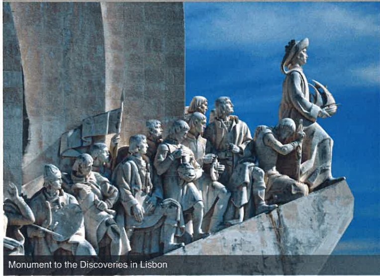
Monument to the Discoveries in Lisbon