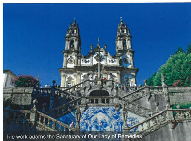
Tile work adorns the Sanctuary of Our Lady of Remedies

Enjoy the morning onboard leisurely sailing along the Douro through landscapes of terraced vineyards and small towns. An afternoon excursion to the countryside visits the wine chateau Quinta do Seixo. Learn about the wine-making process of Port wine before sampling the vintage from the tasting room offering spectacular views of the river valley and vineyards below. This is sure to be a life-enriching experience! Touring continues in