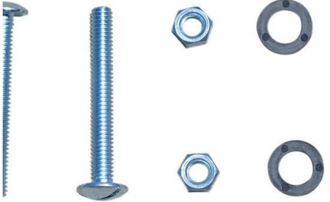
Metal signpost with hardware $62