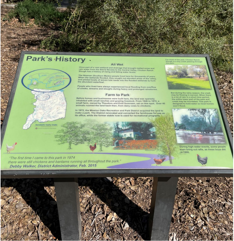
Park trail signs