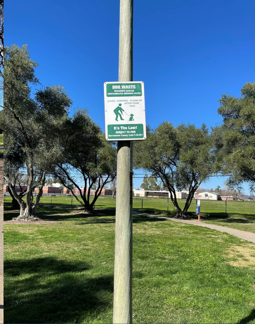
Dog rules signs